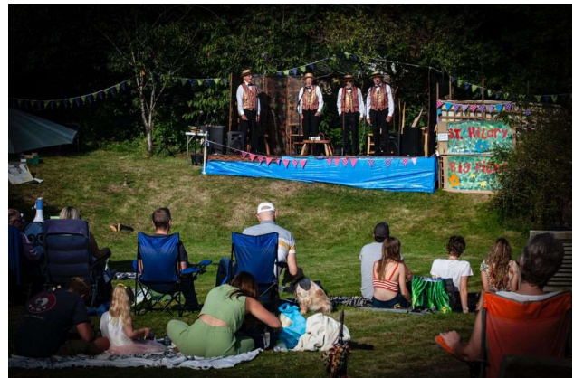
The Old Spice Barbershop quartet kicking off the entertainment.