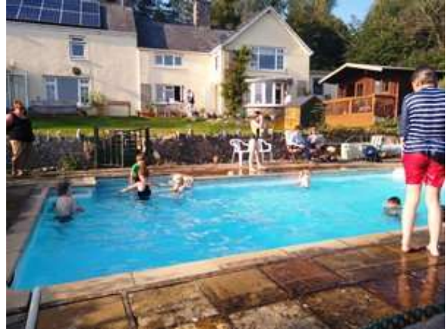
Villagers enjoying the pool on a lovely afternoon.