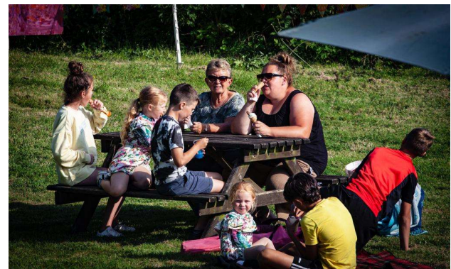
Lewellyn family picnic table.